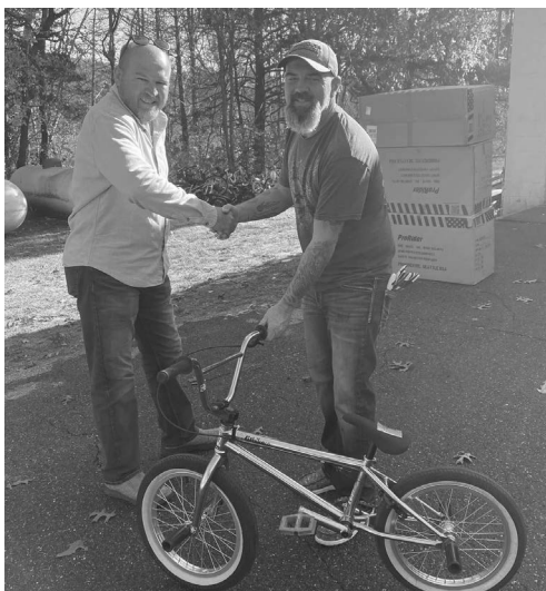
Early this year our 25,000th bike went out the door!

600 bikes of the 1,000 given this year went to the following organizations (the rest were individuals or smaller groups):