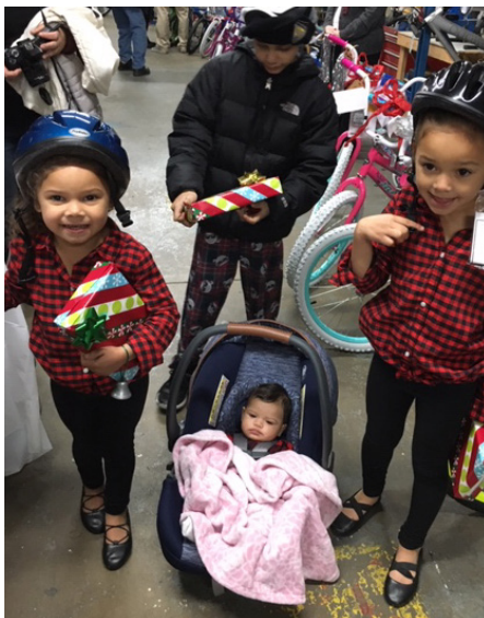
2019 Holiday Giveaway

We are all experiencing tough and difficult times due to the arrival of Covid. Stores and restaurants have limited hours and many people are out of work. Even the Essex North Pole Express will not run this year. In spite of missing the train this year, BFK has decided to continue with their bicycle give away at the Wheelhouse. We are in the process of determining, with the help of several schools and their social workers, 40 young people who may not have a bike or have the means of owning one in the foreseeable future. BFK plans to have a brand new bike, helmet and set of lights all ready with each recipient's name on them and ready to take home just in time for Christmas. We all feel how important it is to keep the magic going, especially during these hard times when people may be struggling. Our founder, Chuck Graeb felt that every kid should have a bike when he began this organization 31 years ago. We look for every opportunity to continue his work to this day. Thank you to all who have helped us with the donation of bikes, parts or a check. Your support keeps the group going.